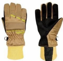
HUNTER Short Beige