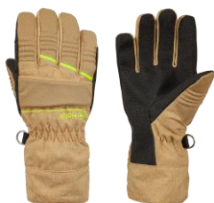
HUNTER Easy Beige