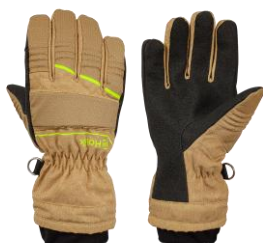
HUNTER Evo Beige