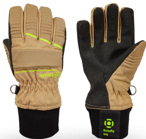
HUNTER Flexi Beige

Protective textile glove with extremely durable PBI® fibre. A sophisticated reinforcement system further increases mechanical and thermal resistance. In addition, the glove has a ceramic coating on exposed areas for increased abrasion resistance.