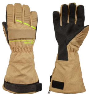
HUNTER Long Beige